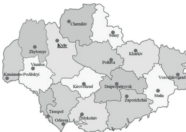
Fig. 1. Administrative division of Ukraine in the 1930 th

In the 1920 th , a temporary division into districts was introduced in the USSR (1923–1930). The modern system of regions and districts of Ukraine has been formed since 1932, when the first 7 regions were formed instead of the current administrative system of 40 districts and 406 districts and 29,938 settlements. The Crimean Autonomous Soviet Socialist Republic existed on the territory of Crimea, which was turned into a region in 1944, and in February 1991 the Autonomous Republic of Crimea was formed on the territory of the Crimean region. In addition to the regions, the Moldavian ASRR (1924–40) existed as part of Ukraine.