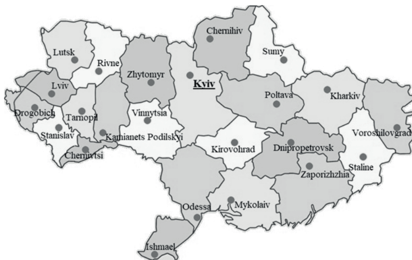
Fig. 2. Administrative-territorial division of Ukraine in 1945